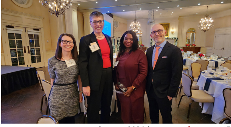
January 2024 | www.nvsbc.org