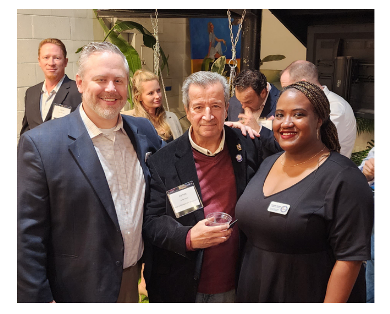
NVSBC co-hosted the Joint Holiday Social in Tampa, FL this past December where new connections were made and NVSBC was joined by friends of the Coalition.