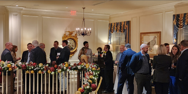
NVSBC was joined by GovForce for the 2023 December DC Networking Dinner + VetFedAcademy event.