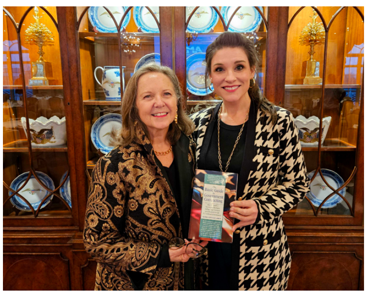
NVSBC hosted it's DC Networking Dinner Event on 24 Jan

NVSBC held it's staff retreat on 25 Jan in Alexandria, VA. We are here to serve SD/VOSB professionals throughout all stages of the business life cycles to operate, sustain, and grow thriving businesses that perform as effective government contractors.