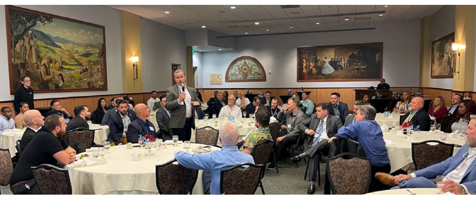
NVSBC joined by FAVOB hosted it's Tampa Networking Dinner Event on 17 Jan, 2024.